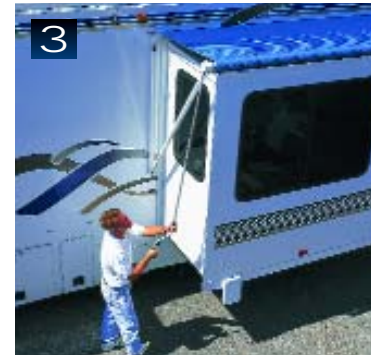
3 The Guardi-Awn rolls out over the edge of the slideout . . .