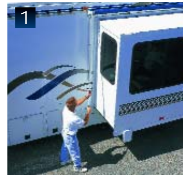
1 Insert the hand crank into the gears and begin to turn.