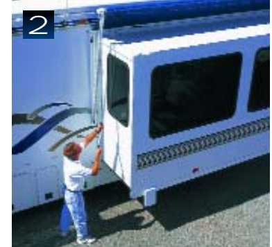
2 As you turn, the Guardi-Awn lifts up and tilts away.