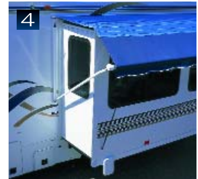
4 . . . and into the window awning position!

You don't have to retract your slideout to retract the Guardi-Awn. Like the Omega II Awning, the Guardi-Awn keeps dirt and debris off the top of your slideout and out of your RV while it shades the window and keeps the interior of the RV cool and comfortable.